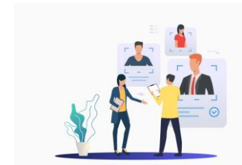
PRESENTATION AND SELECTION OF PROFILES WITH THE OPERATIONAL MANAGEMENT