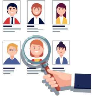
CANDIDATE SEARCHING / SPONTANEOUS APPLICATION