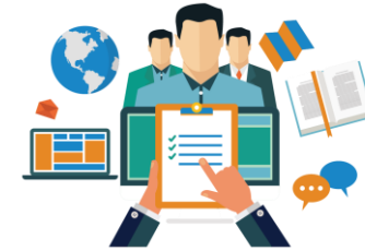
FACE-TO-FACE OR REMOTE INTERVIEW