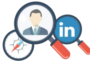
DECISION MAKING WITH THE OPERATIONAL MANAGEMENT