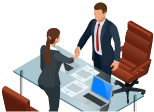
COMMUNICATION AND INTEGRATION INTO THE COMPANY