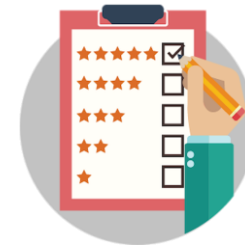
INTERVIEW OR TECHNICAL TEST